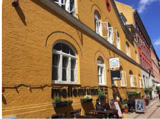
The front of Globalhagen Hostel